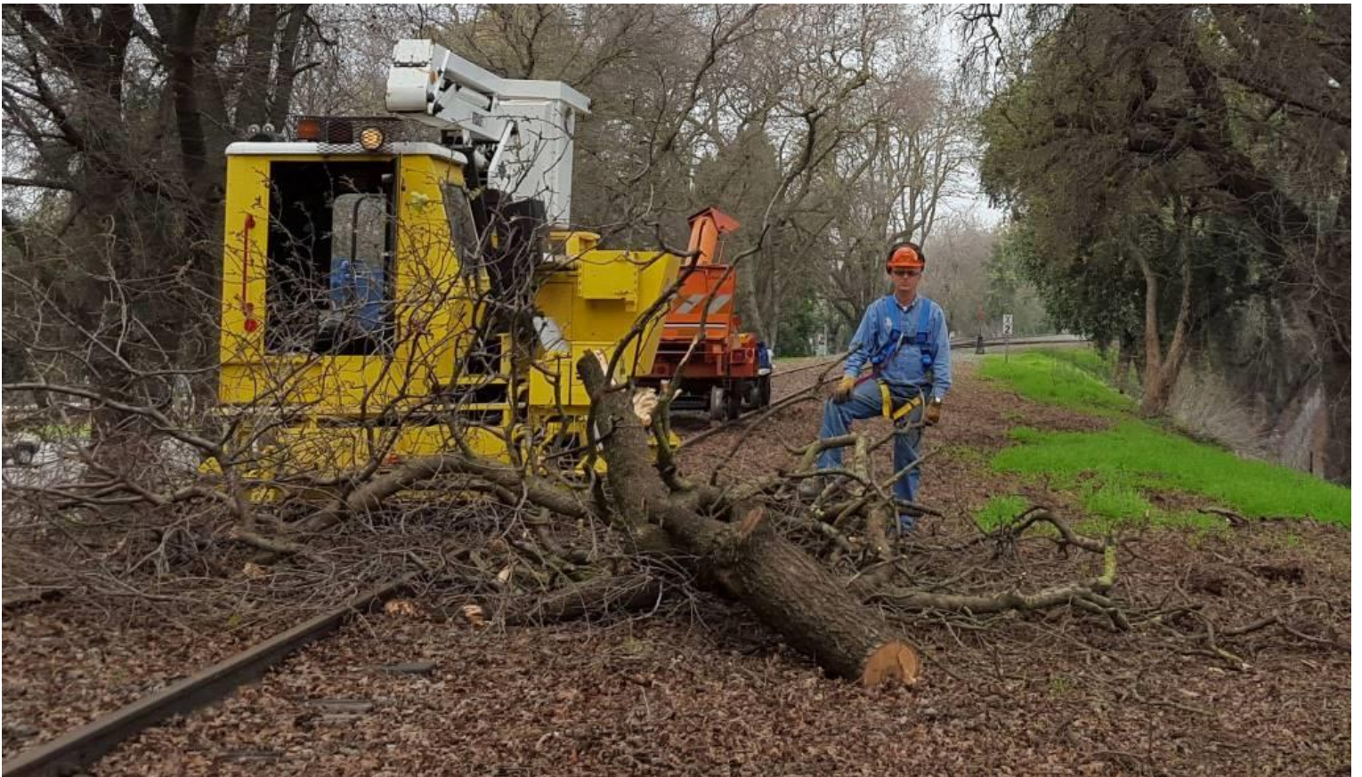
Mongo with leg on top of his wooden quarry declares victory!