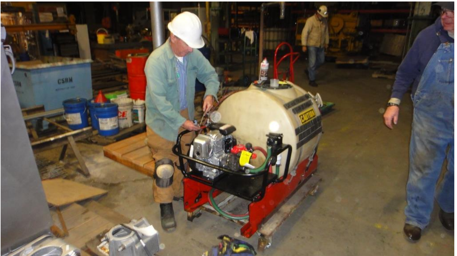
The 65-gallon spray-rig looks nearly brand new!