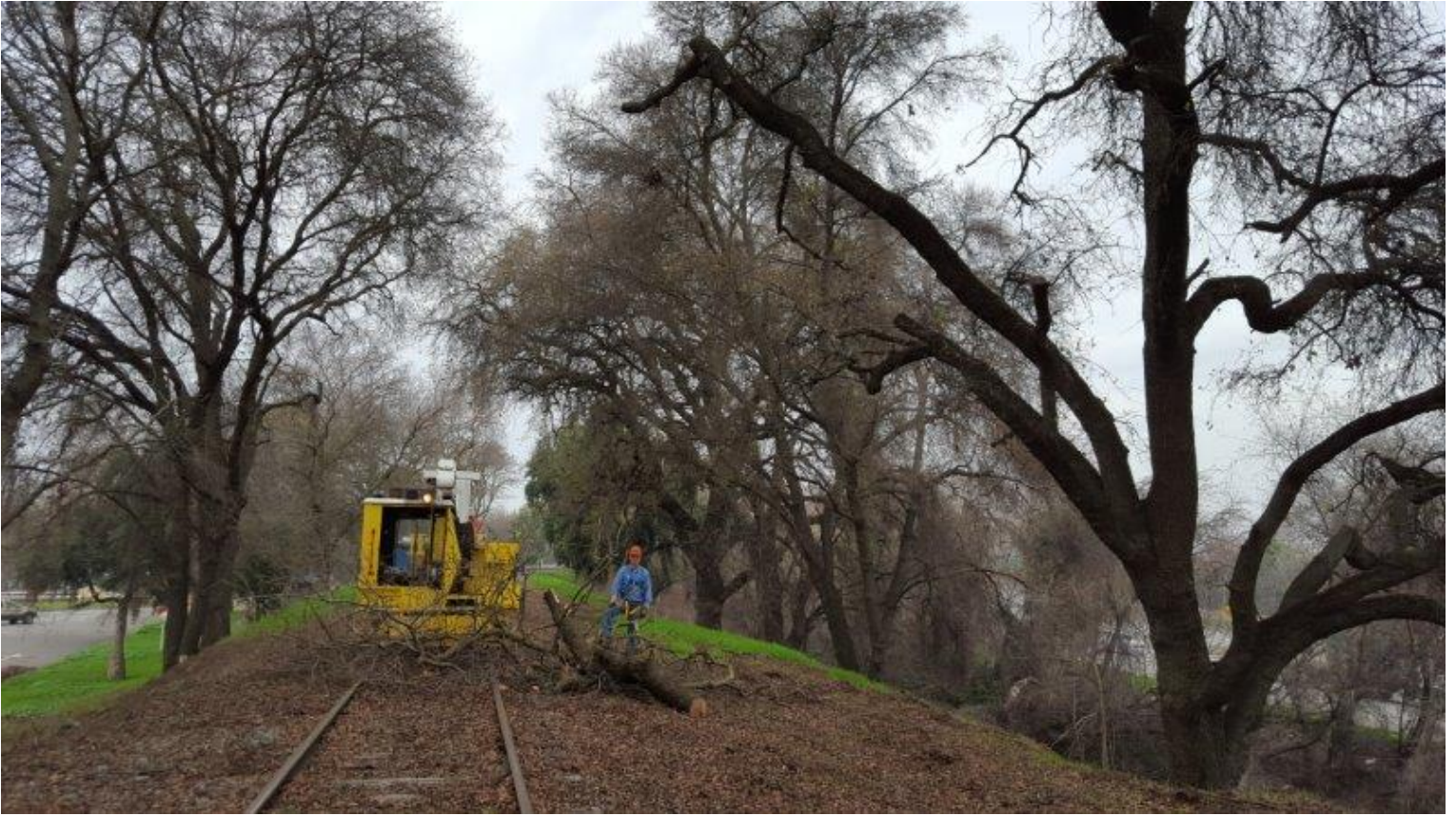
The "Sword of Damocles" limb over the SSRR Mainline is removed by the Mighty MOW Weed Team