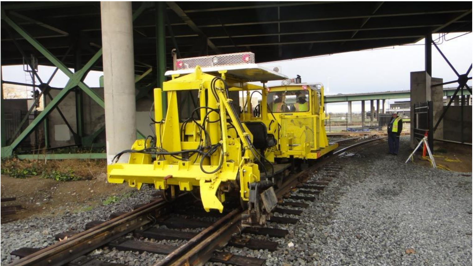
...Over the UP Main and to the Shops